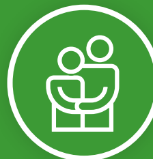
Time with your partner